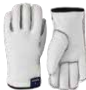
020 Off White