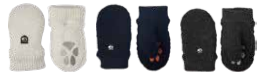
020 Off White