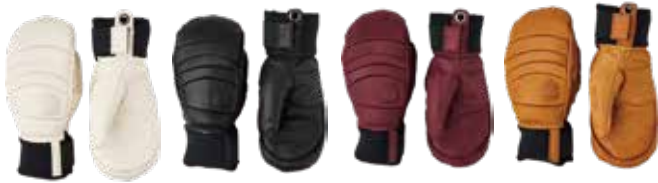
060 Almond White

Lining : Removable Bemberg polyester (34420)