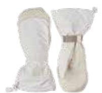
020 Off White