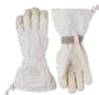
020 Off White