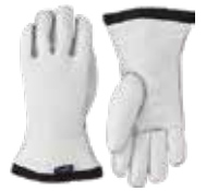
020 Off White