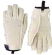
020 Off White