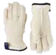
020 Off White