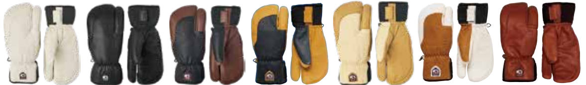
060 Almond White

Material : Back : (all colors)_Impregnated cowhide Palm : (100)_Goat Army leather, (710060)_Chrome Free Goat leather (280750, 350700, 700701,750)_Impregnated cowhide (060) Palm and back Chrome free goat leather Lining : Removable bemberg polyester /G-loft Features : Neoprene cuff