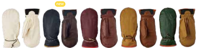
060 Almond White

Features : Neoprene Cuffs, Paracord, Handcuffs