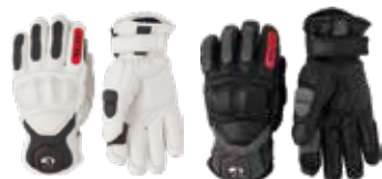
000540 100540 White/Flame Red Black/Flame Red

Material : Outer : Impregnated Goat Leather Insulation : G-loft polyester Lining : Brushed Polyester Features : Knuckle Protection Shock absorbing material on finger