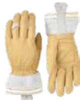
700 Natural Brown