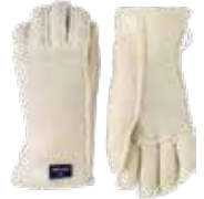
020 Off White