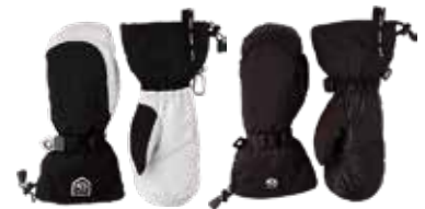
100020 Black/Off White

Features : Snow lock, Crabiner, Handcuffs