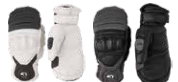
000540 100540 White/Flame Red Black/Flame Red

Material : Outer : Impregnated Goat Leather Insulation : G-loft polyester Lining : Brushed Polyester Features : Knuckle Protection Shock absorbing material on finger