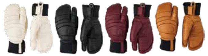
060 Almond White

Lining : Removable Bemberg polyester (34420)