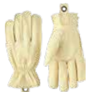
700 Natural Brown