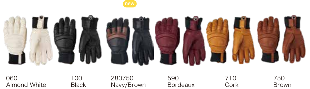
060 Almond White

Lining : Removable Bemberg polyester (34420)