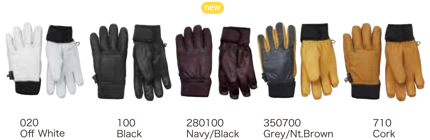
020 Off White