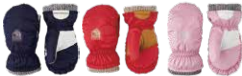
290 Dark Navy