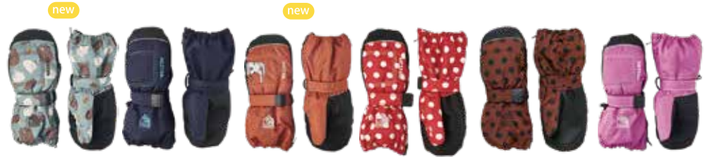
239 Sea Blue Print