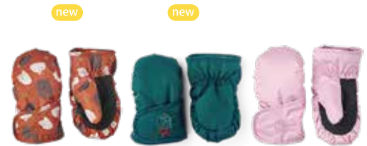
539 Brick Red Print