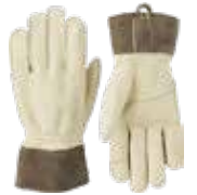
400 Natural Yellow

Material : Outer : Chrome free Chamois Goat leather