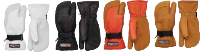
020 Off White

Material : Back : (all colors)_Impregnated cowhide Palm : (020,100)_Army Goat leather (540710,710)_Impregnated cowhide Lining : Removable bemberg polyester