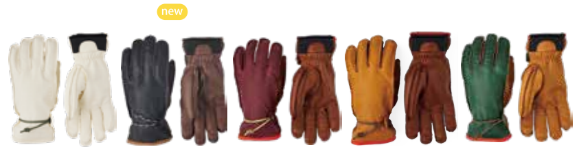
060060 Almond White

Features : Neoprene Cuffs, Paracord, Handcuffs