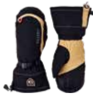
100720 Black/Light Brown