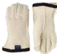
020 Off White