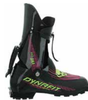
DNA PRO BOOT 61332

税込価格 ¥727,210 (取扱価格 ¥661,100) 0983 BLACK OUT / PINK GLO Weight:510g Size:23 - 30cm Width:99mm Flex:- Rotation:75° Forward:12°/18° Liner:Race400 Outsole:Pierre Gignoux SHELL:Carbon CUFF:Carbon □Full Carbon Construction □Race Lock PRO by Pierre Gignoux