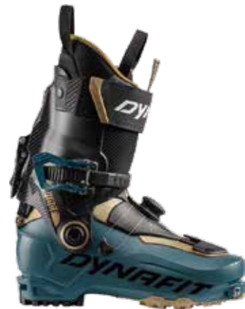
RIDGE BOOT M 61936

税込価格 ¥165,110 (取扱価格 ¥150,100) 4091 BALSAM/BLACK OUT Weight:1280g Size:25-30.5cm Width:101mm Flex:110 Shell:Grilamid® Cuff:Grilamid® loaded with glass fibers □Master Step□HOJI Lock□Lightweight□Floating Tongue