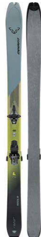
RADICAL 88 SKI SET M 49728