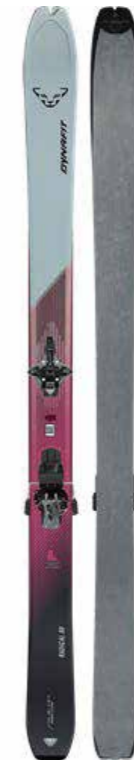
RADICAL 88 SKI SET W 49729