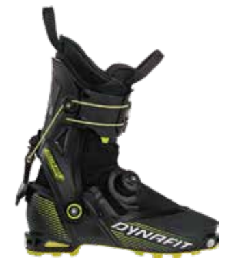
MEZZALAMA BOOT 61942

税込価格 ¥309,760 (取扱価格 ¥281,600) 0983 BLACK OUT / PINK GLO Weight : 780g(26.5cm) Size : 22.5 - 30cm Width : 98mm Flex : - Rotation : 70° Forward : 10°/13° Liner : DNA Bikini Outsole : VIBRAM lite base SHELL : Grilamid CF loaded CUFF : Carbon(laminated)with Pebax flap TONGUE : Gaiter □Race Lock 2.0 □Master Step □Lightweight □Twistfit