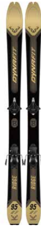
RIDGE 95 SKI 49719