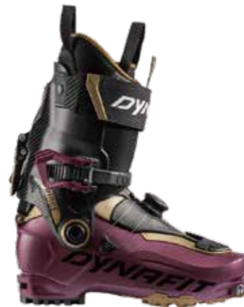
RIDGE BOOT W 61937

税込価格 ¥165,110 (取扱価格 ¥150,100) 4091 BALSAM/BLACK OUT Weight:1280g Size:25-30.5cm Width:101mm Flex:110 Shell:Grilamid® Cuff:Grilamid® loaded with glass fibers □Master Step□HOJI Lock□Lightweight□Floating Tongue