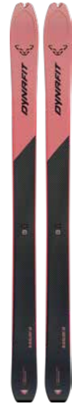
BLACKLIGHT 88 FI 70 SKI 49722