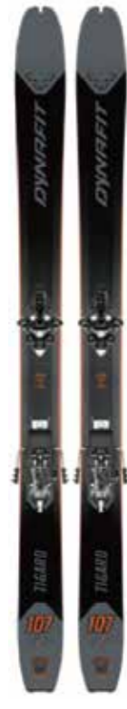
TIGARD 107 SKI 49712