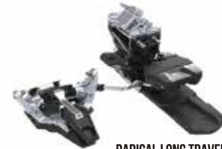
RADICAL LONG TRAVEL