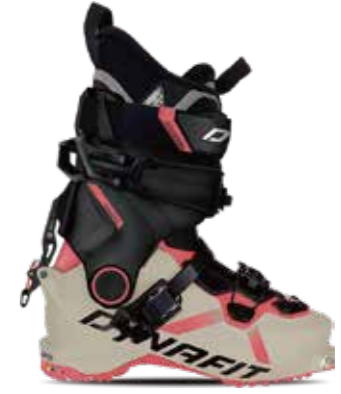
SEVEN SUMMITS BOOTS W 61948

税込価格 ¥125,620 (取扱価格 ¥114,200) 4579 SHOCKING ORANGE/OVERCAST Weight:1495g(26.5cm) Size:25-31.5cm Width : 103.5mm Flex:110 Shell:PU (Radicalmold) Cuff:Mafram(New) Inner:Seven Summits □Driving Spoiler 2.0□Velcro Power Strap□ISO 9523□Quick Step In □Speed Lock□Buckle Microregulation