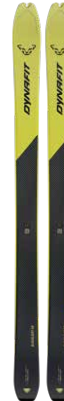
BLACKLIGHT 88 FI 90 SKI 49721