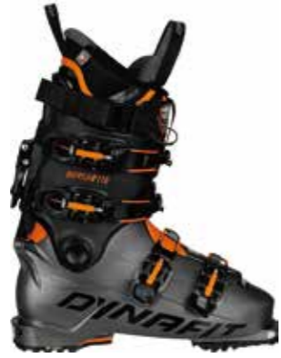
TIGARD 110 BOOT UNI 61932

税込価格 ¥194,480 (取扱価格 ¥176,800) 5755 CAPULET OLIVE/FLUO ORANGE Weight:1550g Size:25-31.5cm Width:101mm Flex:130 Inner:Dynaflitter15 □ISO9523 □Hoji Lock □Gripwalk Outsole □Overlap Construction Shell: Grilamid® / Spoiler: Grilamid® Cuff: Grilamid® Loaded with Carbon Fibers