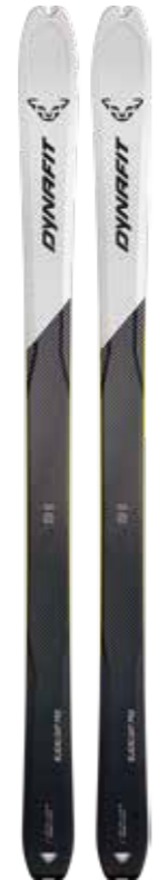
BLACKLIGHT PRO TOURING SKI UNISEX 48493