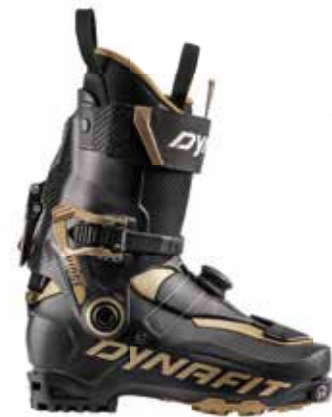
RIDGE PRO BOOT M 61934

税込価格 ¥176,900 (取扱価格 ¥160,900) 0909 BLACK OUT/GOLD Weight:1250g Size:25-30.5cm Width:101mm Flex:120 Shell: Grilamid® with Carbon Fibers / Spoiler: Grilamid® / Cuff: Grilamid® with Carbon Fibers □Floating Tongue □Hoji Lock □Lightweight