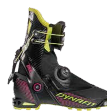
DNA BOOT 61941

税込価格 ¥727,210 (取扱価格 ¥661,100) 0983 BLACK OUT / PINK GLO Weight:510g Size:23 - 30cm Width:99mm Flex:- Rotation:75° Forward:12°/18° Liner:Race400 Outsole:Pierre Gignoux SHELL:Carbon CUFF:Carbon □Full Carbon Construction □Race Lock PRO by Pierre Gignoux