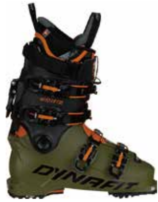
TIGARD 130 BOOT UNI 61931

税込価格 ¥194,480 (取扱価格 ¥176,800) 5755 CAPULET OLIVE/FLUO ORANGE Weight:1550g Size:25-31.5cm Width:101mm Flex:130 Inner:Dynaflitter15 □ISO9523 □Hoji Lock □Gripwalk Outsole □Overlap Construction Shell: Grilamid® / Spoiler: Grilamid® Cuff: Grilamid® Loaded with Carbon Fibers