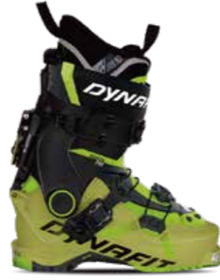
RADICAL PRO BOOT M 61943

税込価格 ¥170,170 (取扱価格 ¥154,700) 0733 MAGNET/FLUO ORANGE Weight:1550g Size:23-31.5cm Width:101mm Flex:110 Inner:Dynaflitter15 □ISO9523 □Hoji Lock □Gripwalk Outsole □Overlap Construction Shell: Grilamid® / Spoiler: Grilamid® Cuff: Grilamid® Loaded with Glass Fibers