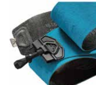
SPEEDSKIN RADICAL 88