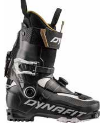
RIDGE PRO SKI TOURING BOOT W 61935

税込価格 ¥176,900 (取扱価格 ¥160,900) 0909 BLACK OUT/GOLD Weight:1250g Size:25-30.5cm Width:101mm Flex:120 Shell: Grilamid® with Carbon Fibers / Spoiler: Grilamid® / Cuff: Grilamid® with Carbon Fibers □Floating Tongue □Hoji Lock □Lightweight