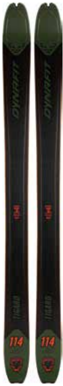
TIGARD 114 SKI 49713