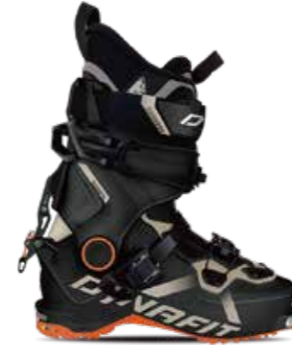
SEVEN SUMMITS BOOTS M 61947

税込価格 ¥125,620 (取扱価格 ¥114,200) 4579 SHOCKING ORANGE/OVERCAST Weight:1495g(26.5cm) Size:25-31.5cm Width : 103.5mm Flex:110 Shell:PU (Radicalmold) Cuff:Mafram(New) Inner:Seven Summits □Driving Spoiler 2.0□Velcro Power Strap□ISO 9523□Quick Step In □Speed Lock□Buckle Microregulation